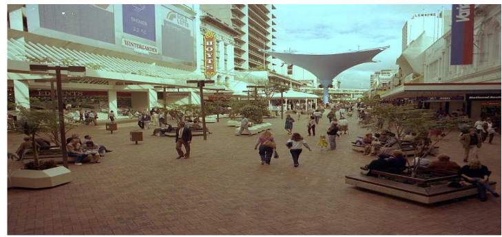
Queen Street Mall 1982