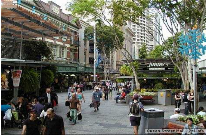
Picture 1 - Queen Street Street Mall