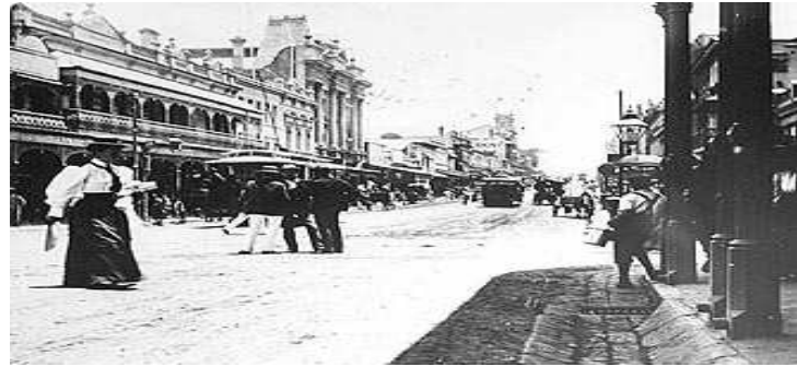
Queen Street 1902