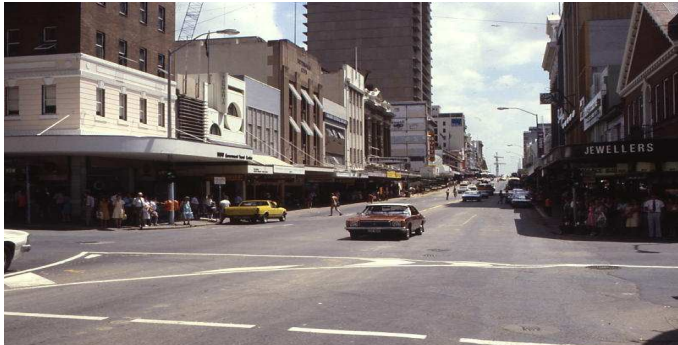
Queen Street 1981