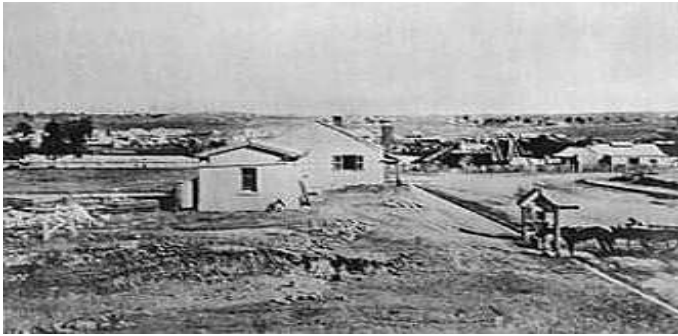
Queen Street 1864