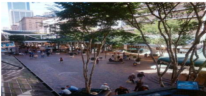
Queen Street Mall 1993