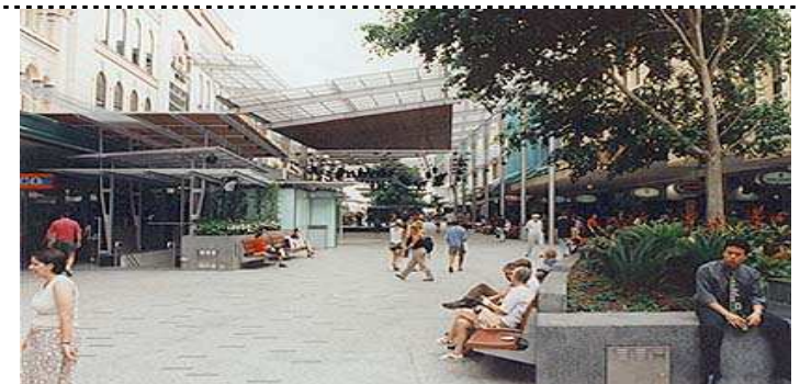
Queen Street Mall 2000

Cut out pictures and glue into time line in the year in which the photographs were taken.