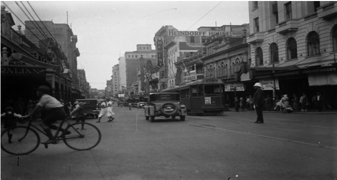
Queen Street 1920