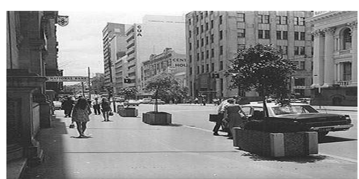
Queen Street 1969